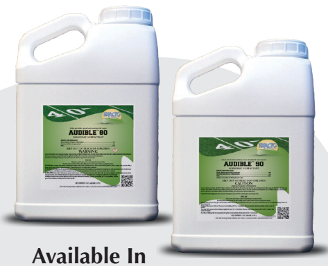
Available In Audible 80: 1 Gallon Jugs